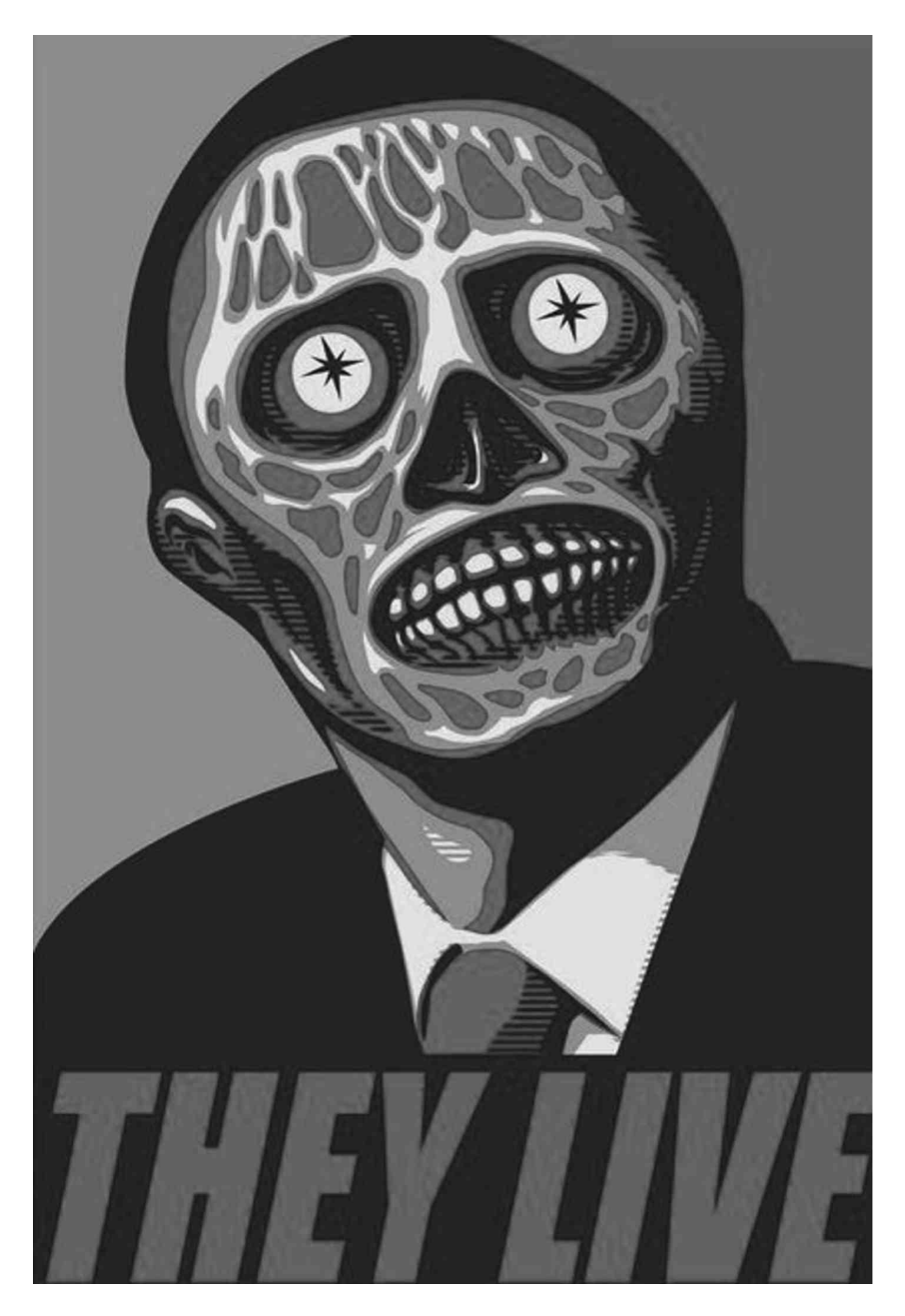
Parody of Sci-Fi movie "They Live" theme.