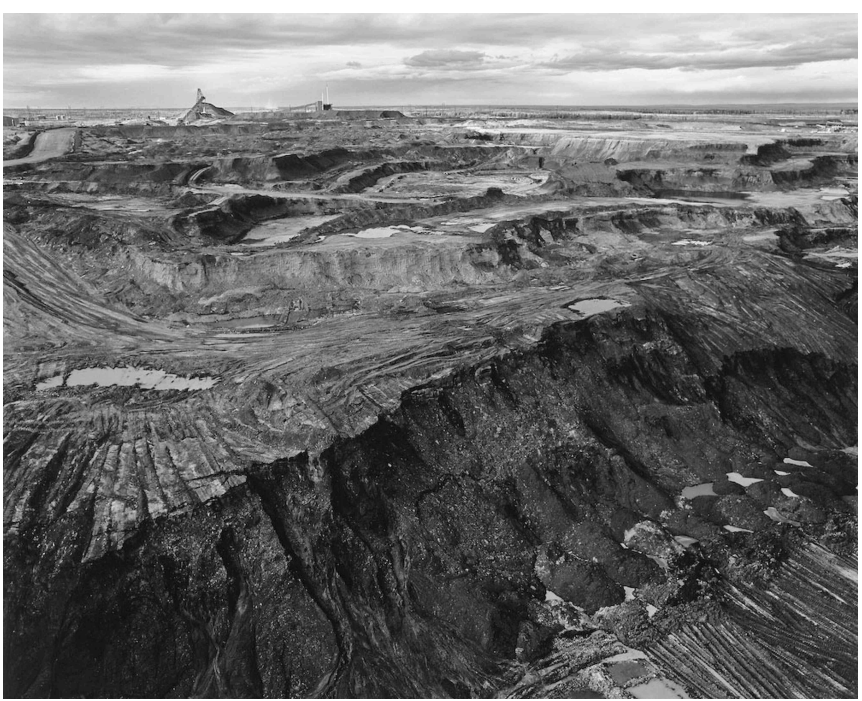
Tar Sands mine in Alberta