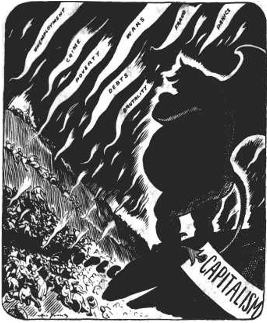
Art Young, The Masses, 1916

Obama initially opposed Bush's military intervention in Iraq – hastening to add that he was not against all wars, God forbid, but only against "dumb" ones. Before leaving office, Bush initiated a gradual and partial withdrawal of troops from Iraq. Obama is pursuing the same course, breaking an earlier promise of rapid and complete withdrawal.